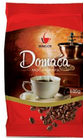
Mingos Coffee 100g