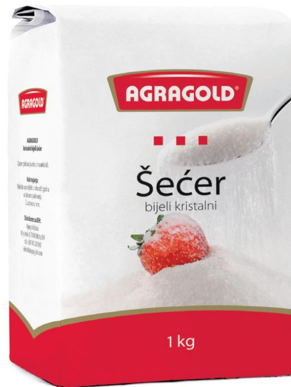
White Crystal Sugar 1kg OPP/paper bag