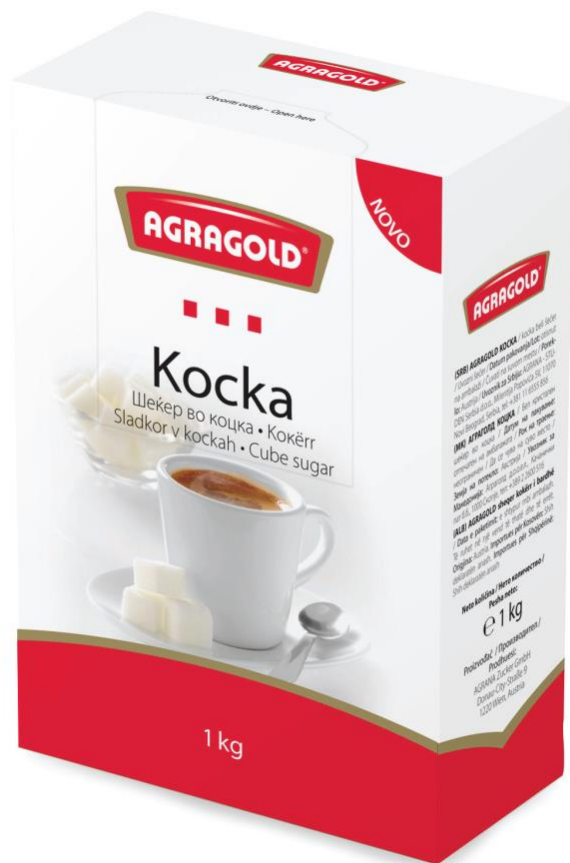
Sugar Cubes 1kg carton box