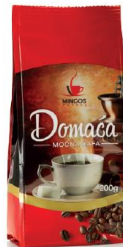
Mingos Coffee 200g