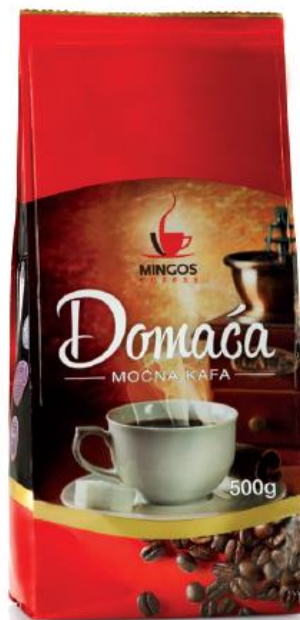
Mingos Coffee 500g