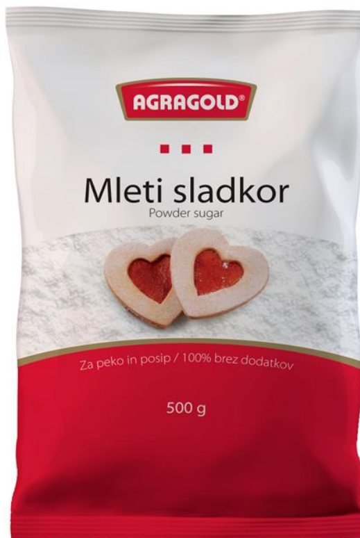
Powder Sugar 500g