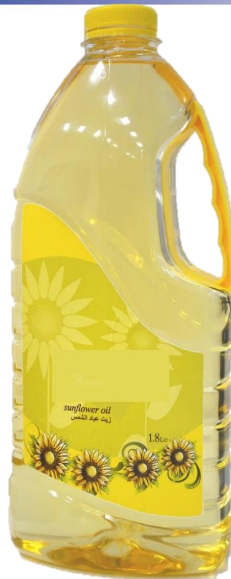
Sunflower Oil 1.8L PET