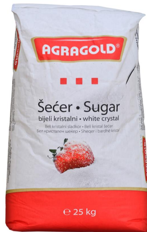
White Crystal Sugar 25kg paper bag