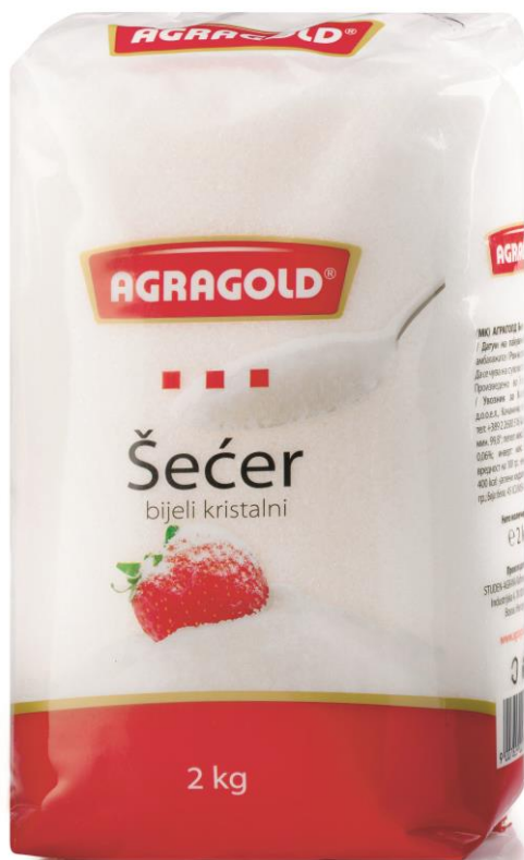
White Crystal Sugar 2kg OPP bag