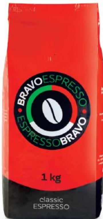
Mingos Coffee 1kg