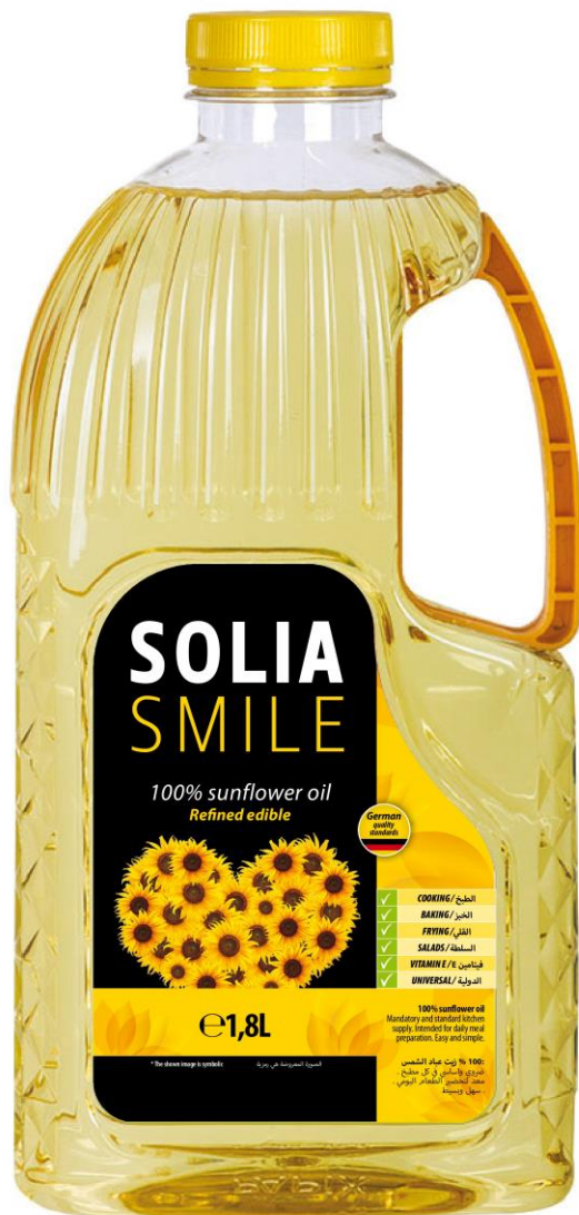
Sunflower Oil 1.8L PET