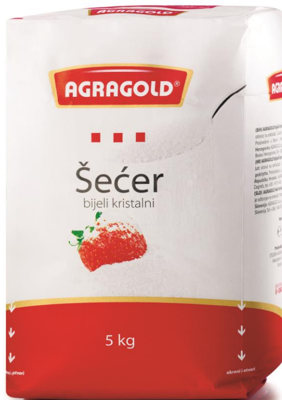
White Crystal Sugar 5kg paper bag